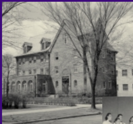
Northwestern House, 1943