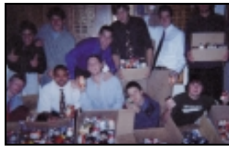
Denver Food Drive

Beta Gamma brought in 11 New Members for the fall 2003 term. The New Members organized "Shirt Off Your Back" canned food drive for a local food bank, the men gathered 400 canned goods and the Chapter gave a $100 donation from their weekly food budget. The Chapter has taken 1st place in floor hockey, 1st place in ice hockey, 2nd place in Greek Week, and our GPA is almost a 3.0! We have focused on risk management and have