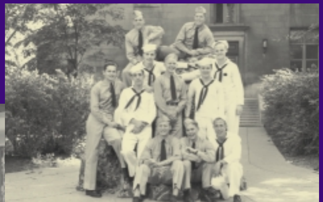
Phi Kap Navy Trainees on the rock at Northwestern Campus