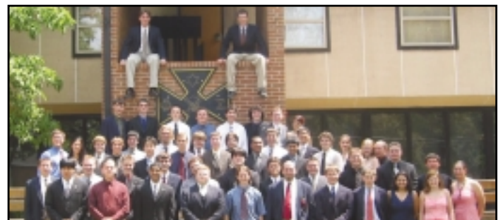
Members of Georgia Tech

Rho Chapter numbers have grown steadily to 22 Brothers and 11 New Members. We have reached out to aid in many house charities, fund raisers, and even helped carve pumpkins at a children's home on Halloween. We all participated in I-Guides in August helping freshmen move into the dorms. Our house claimed a strong GPA of 3.09 greatly boosting our house ranking. Our 11 New Members will spend one week before the start of spring semester working on the house and bonding in Brotherhood.