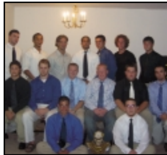
Members of Wesley

We at Beta Psi are proud to announce the turning of a corner this fall. Faced with a do or die recruitment this summer, the