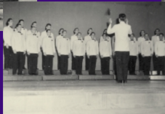
Choral Songfest – Phi Kappa Sigma won the competition against all other fraternities on campus.