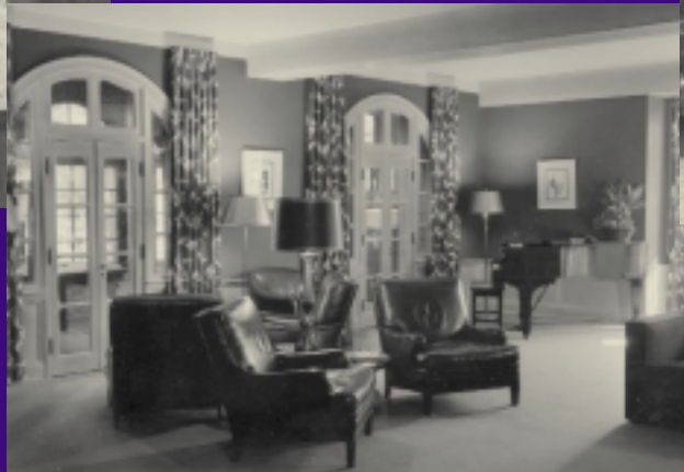
Interior of Northwestern House after recent redecorating