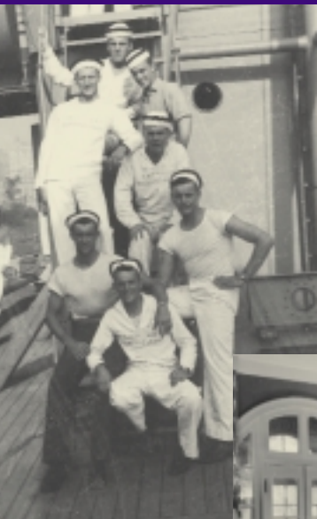
Phi Kap Navy Trainees aboard the U.S.S. Wilmette, Lake Michigan