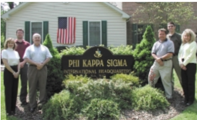
International Headquarters Staff: (Left to Right)