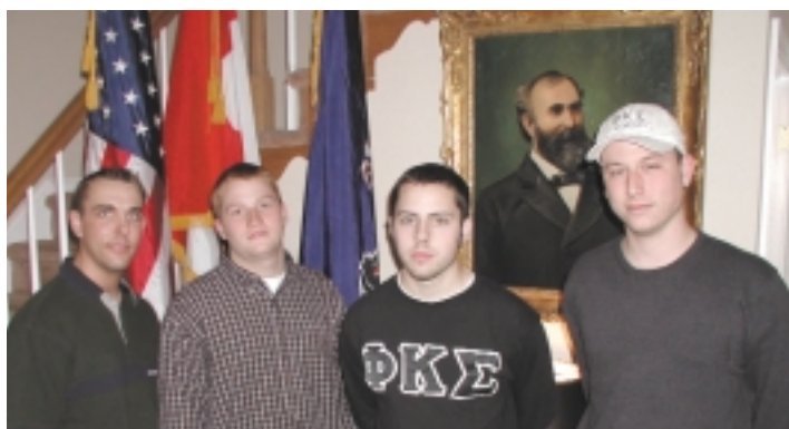
Members of UNC – Charlotte visit the International Headquarters