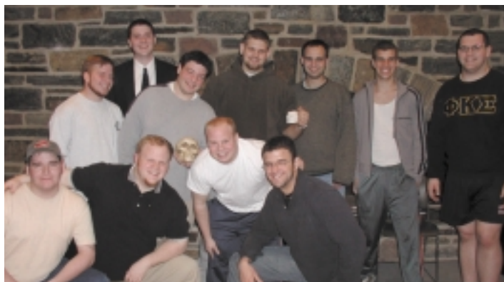
Members of Ursinus College