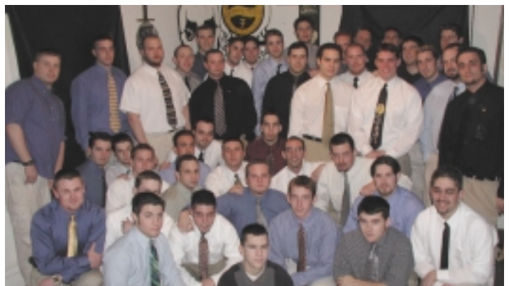
Members of Rowan University

Rowan University Delta Gamma Chapter initiated 16 new members this year. The Chapter held two events