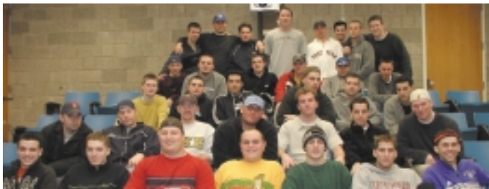
Members of Seton Hall

second in GPA with a 3.13. The Chapter instituted a new anti-hazing pledge, adopted a homeless dog, renovated and opened a new house, and received the highest award on the Rutgers University Fraternal Annual Report.