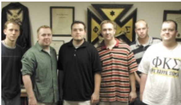
Members of West Chester University visit the International Headquarters

The Chapter went through a devastating fire that destroyed their house, but were able to keep their grades at an acceptable level, remain heavily active with both the school and the community, and became closer as a Brotherhood.