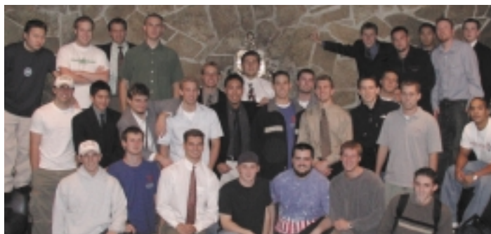
Members of University of Washington

the Leukemia and Lymphoma Society by holding a benefit concert. The Chapter also raised over $200 for the Red Cross, and donated to both the Children's Miracle Network and the National Colorectal Cancer Research Alliance. The Chapter is currently working on purchasing/renting a new house, and is looking forward to next year.