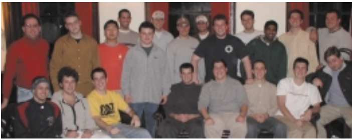
Members of University of Pennsylvania

diagnosed with Leukemia. The Chapter parked cars and acted as honor guards for a Marist College ceremony. They organized and hosted a Halloween party for area grade school students, and participated in the American Heart Association Annual Walk. The Brothers also cleaned and moved furniture at the Esopus Retreat Facility. They were the 2002 Greek Week Winners. They had the highest grossing fundraising event in school history, and received the most individual awards for members having an average of 3.2 or higher.