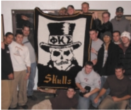
Members of Washington State University

Beta Psi initiated 6 new members this year, and participated in many community service events. The