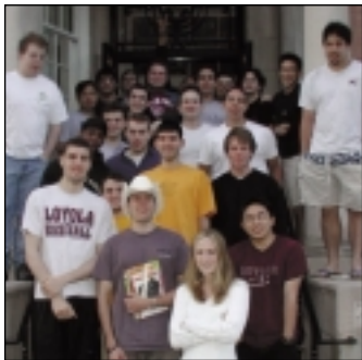
Members of MIT

most active Greek organization, but the most dynamic club or organization on campus. At the Sixth Annual Scholarship Recognition Ceremony, our Chapter received the most individual awards for members having a cumulative average of 3.2. With the initiation of the New Members this semester, we will have a grand total of 14 New Members for the school year, up from 9 the previous year. As you can see, things at Delta Iota are going very well and we are striving to become the top Chapter of Phi Kappa Sigma.