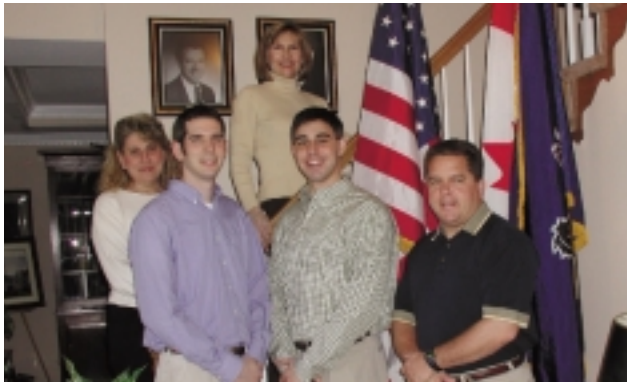
International Headquarters Staff (Left to Right)