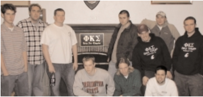
Members of the Washington State

and we are focusing on a large recruitment campaign for the fall term. We feel that with the support of these groups, and hard work from our membership, our Brotherhood can and will flourish.