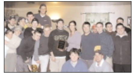
Members of Marist College

tremendous improvements in our relations with the University and the International HQ. The Chapter often holds events on campus known as "Late Night Alternatives" that offers students alternative activities to drinking. We are also proud to note that we have 2 New Members this semester who have truly stepped up to the role of becoming a Phi Kap.