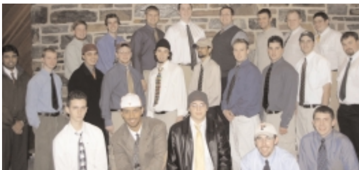
Members of Ursinus College

In the past few months Beta Omicron has taken a number of steps in order to rebuild and develop our Chapter. We have recently, with a great deal of help from alumni, created an Alumni Advisory Board. Along with the Alumni Advisory Board, we are working with Phi Kap Headquarters and our IFC and have received a great deal of support from each of them in our efforts to return to being a model Chapter on campus and nation wide. We are in the process of looking for a new Chapter House,