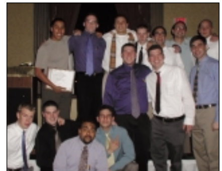
Members of Johnson & Wales University

Things at Delta Iota Chapter are going very well. We have participated in numerous on campus activities including alumni softball games, freshman move in, stage buildups, Sept 11th Tribute Ceremony, Esopus Retreat House Cleanups, a Coat Drive, a Can Drive, and a Donate-a-Meal