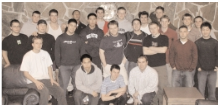
Members of the University of Washington

The Alpha Iota Chapter has continued to increase its membership through both fall and spring New Member Classes. We are currently third on Vanderbilt's campus in numbers with a total of 18 New Members during the school year. We also rank third on campus in GPA. We have been working hard