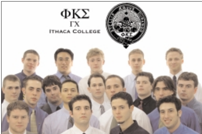
Members of Ithaca College