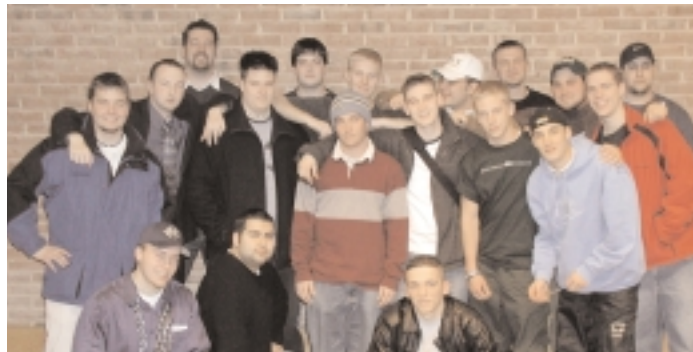
Members of Towson University

The Gamma Epsilon Chapter spent most of the year reorganizing and restructuring our Chapter in the wake of the school mandated fall suspension. Despite this setback, our Chapter has managed to pull together a number of community service events as well as Chapter events to re-instill the core values of our Brotherhood. In the fall, 15 of our Brothers donated an entire day of community service helping to set up and then clean up for the US