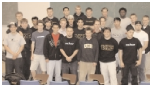
Members of UC-Riverside

of 28, all New Members at this point. We are now preparing for a successful spring recruitment the first week of April, and hope to draw anywhere from 10-20 New Members. We at Alpha Psi have also had great success finding alumni support. On the date of the Pledging Ceremony, we held an Alumni Smoker in which more than 40 alums showed up to give support! We hope that very soon the Alpha Psi Chapter will be up and running once again.