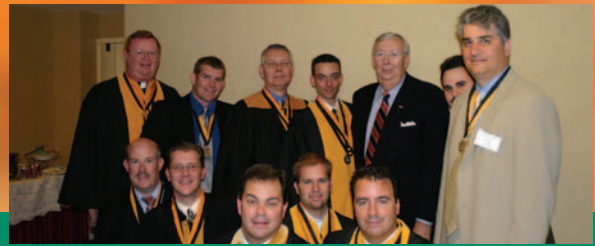
Secretary of the Air Force Dr. Roche (IIT '60) with the Executive Committee