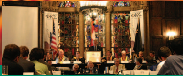
Grand Chapter General Assembly