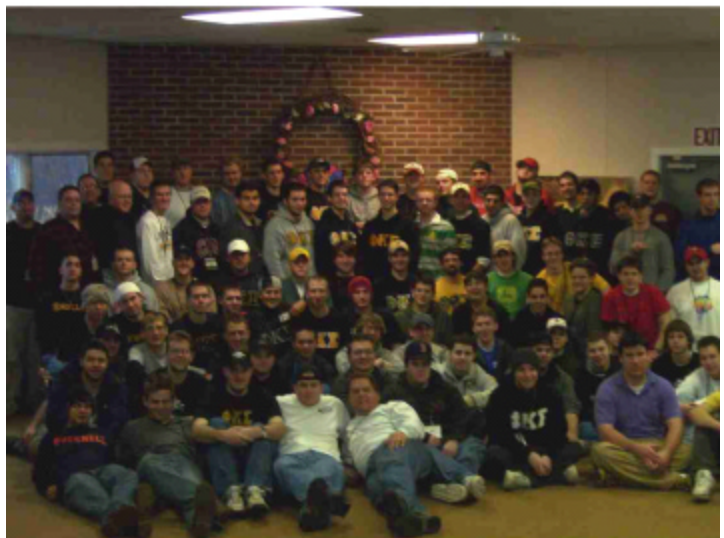
Men of Honor 2005 Participants

All members of Phi Kappa Sigma are eligible to attend. No previous leadership experience is necessary, however, participants will need to possess a strong desire to learn about themselves, be committed to fraternal values, and be an active participant throughout the